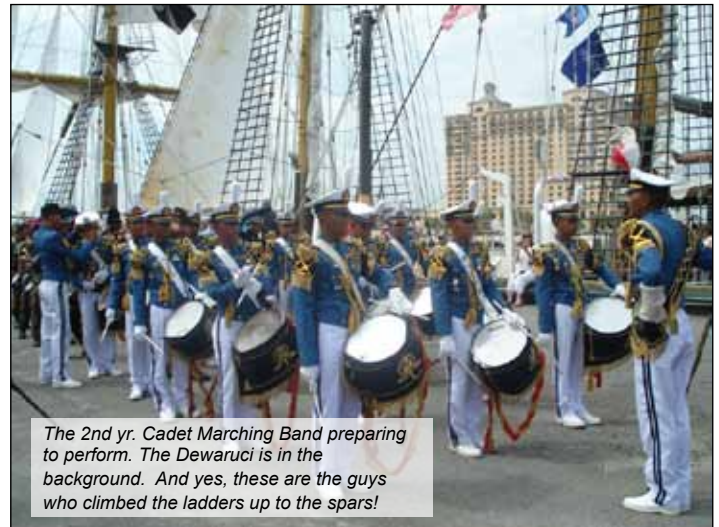
The 2nd yr. Cadet Marching Band preparing to perform. The Dewaruci is in the background. And yes, these are the guys who climbed the ladders up to the spars!