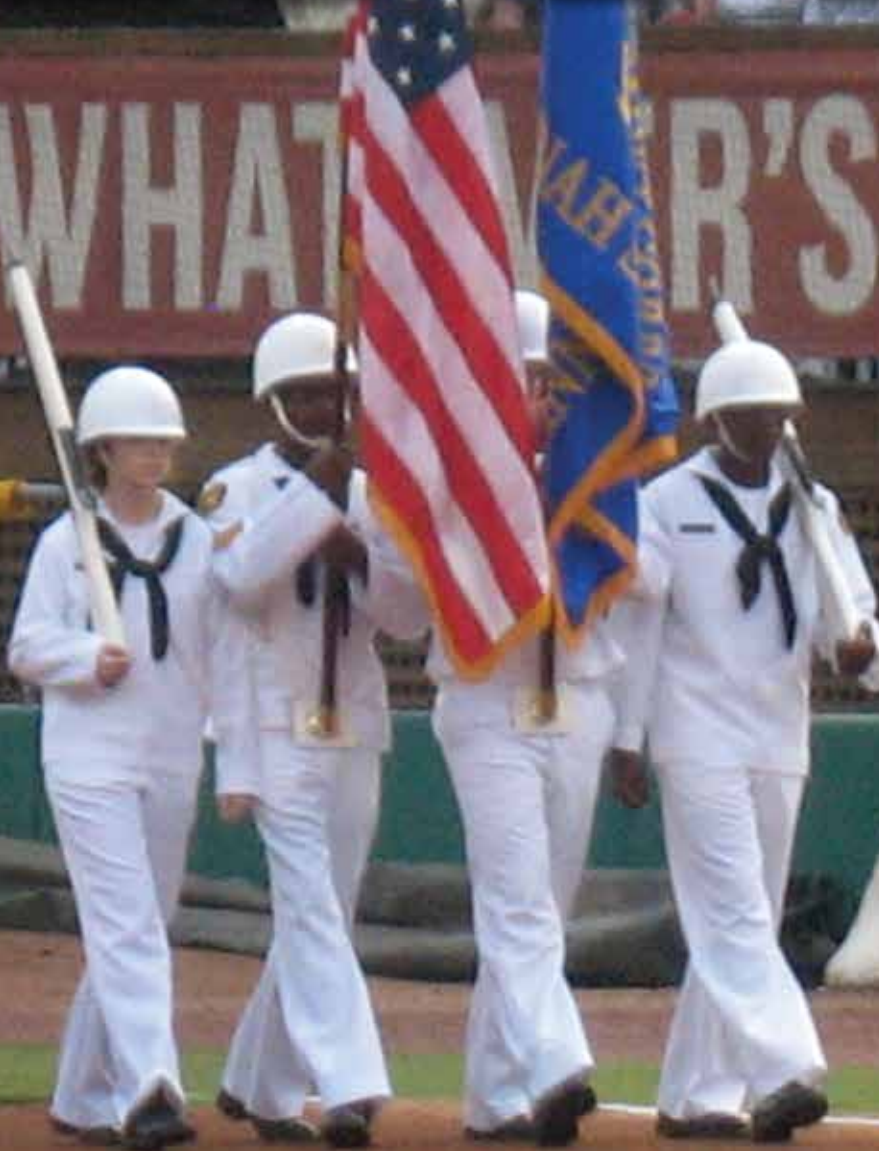
Navy League Sponsored Savannah Squadron Sea Cadets Color Guard - Annual Coast Guard Night at the Sand Gnats Baseball Game.